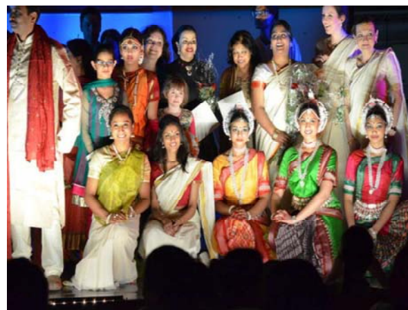
'Prerna' an open stage programme aimed at inspiring and motivating talented dance artists on 22 February 2014