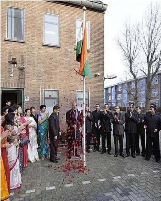
Flag hoisting at Gandhi Centre

was attended by the Indian diaspora and Surinami Hindustani Community. The event was well attended by members of Indian diaspora and the Surinami-Hindustani community. A reception for Dutch dignitaries, members of the Diplomatic Corps and the Indian diaspora and the Surinami Hindustani Community and friends of India was hosted on 27 January 2014.