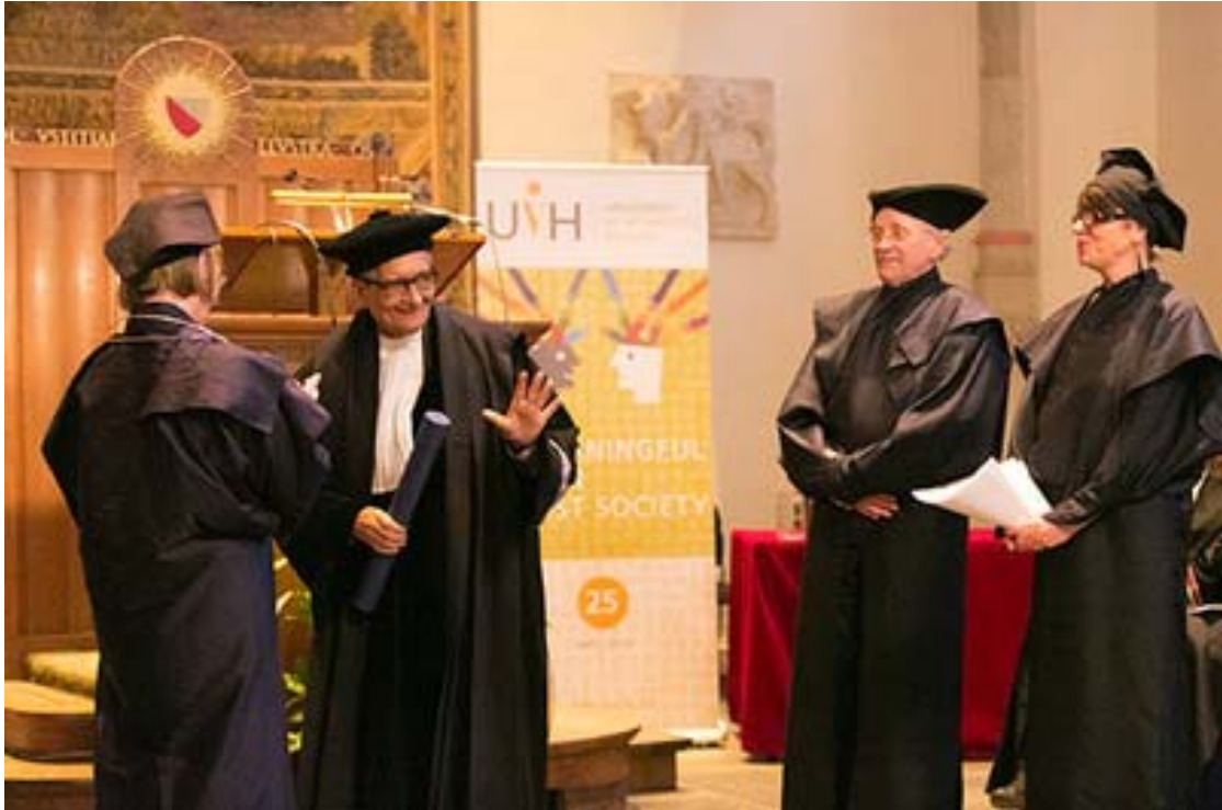
Prof. Amartya Sen being awarded the Honorary Doctorate by the University of Humanistic Studies, Utrecht on 29 January 2014