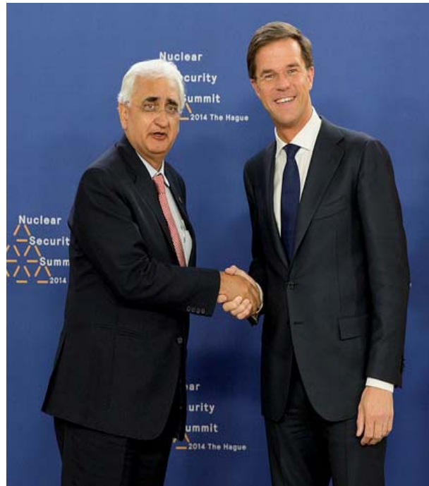
External Affairs Minister, H.E. Mr. Salman Khurshid with the Dutch Prime Minister, H.E. Mr. Mark Rutte during the NSS 2014 in The Hague