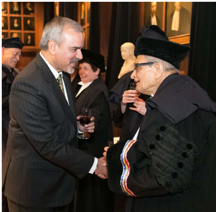
Ambassador of India with Prof. Dr. Amartya Sen at the reception following the conferment of Honorary Doctorate on Prof. Sen by University of Humanistic Studies, Utrecht on 29 January 2014.