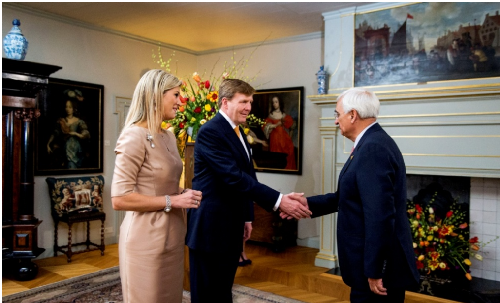
External Affairs Minister H.E. Mr. Salman Khurshid with Their Majesties King Willem-Alexander and Queen Maxima of the Netherlands during the NSS 2014 in The Hague